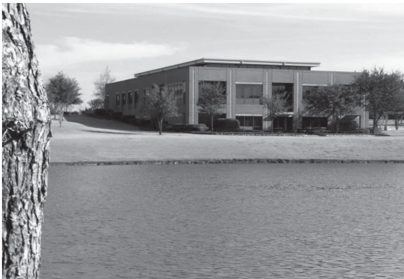
New Big 12 Headquarters as of August, 2006 Irving, Texas