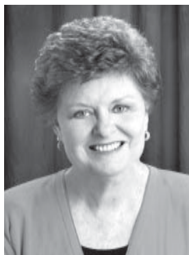
Jody Conradt Head Coach